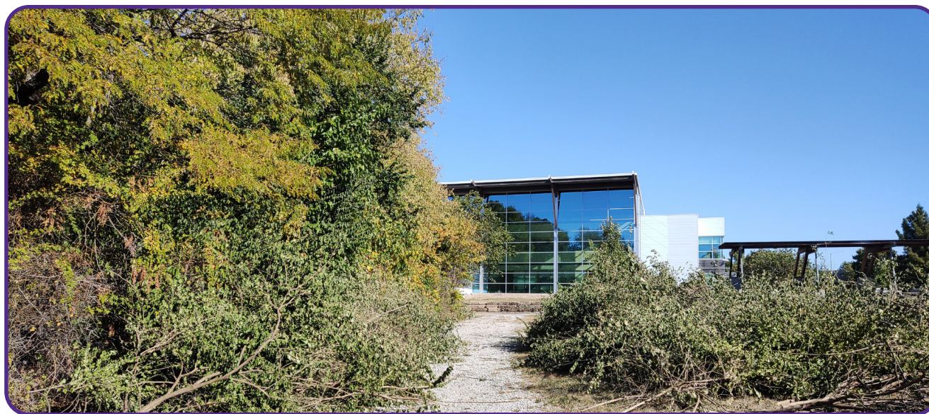
Piles of honeysuckle removed from the area behind the Sunset Government Building

In 2025, 222 Extension Master Naturalists volunteered over 12,862 hours to community educational projects. This is an increase of over 3,300 hours from last year's 9,500 .