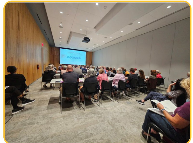
New to Medicare Class at Olathe Public Library

Johnson county residents saved $137,911 by adjusting Medicare plans