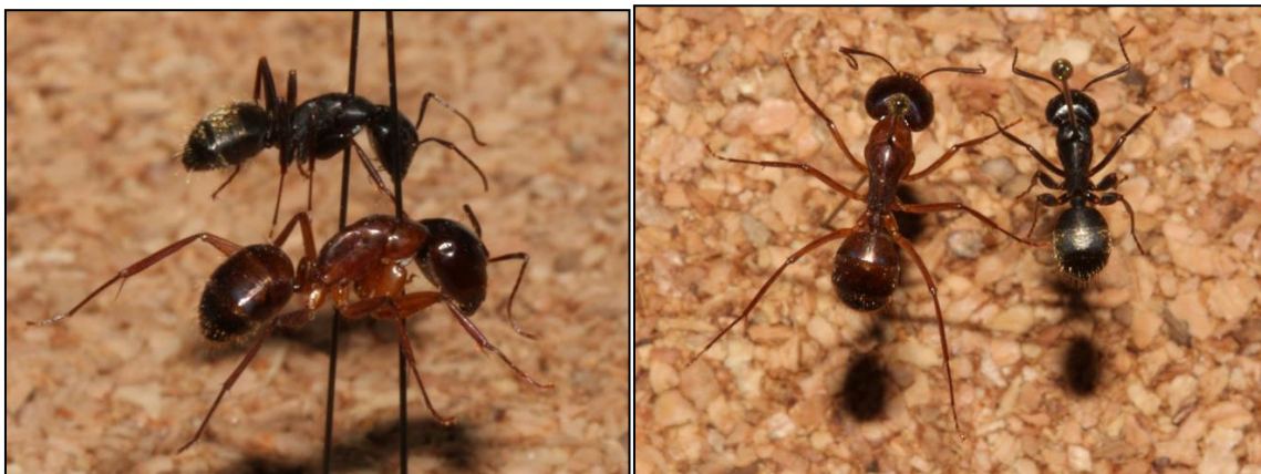
Showing red and black carpenter ants

If the swarm is determined to be ants, the next question is whether they are carpenter ants. Most of our ants are scavengers and therefore won't really cause a problem, other than being a nuisance. Carpenter ants are also scavengers; however, they do excavate and nest in soft woods including plywood, plasterboard, insulation, wood affected by water seepage, etc. Unlike termites, they do not consume wood and wood products. Carpenter ants range in size from 1/4 inch to nearly 1 inch long and may be reddish to black in color, making them look very similar to many other ant species in Kansas. For many, the easiest characteristic to positively identify carpenter ants is the tiny ring of hairs on the very end of the abdomen, which may require a hand lens to see. Treatment for carpenter ants, as with most ants, is most effective by locating and treating the nest.