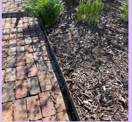
Shawnee Town Gardens Metal Edging