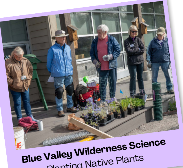
Planting Native Plants