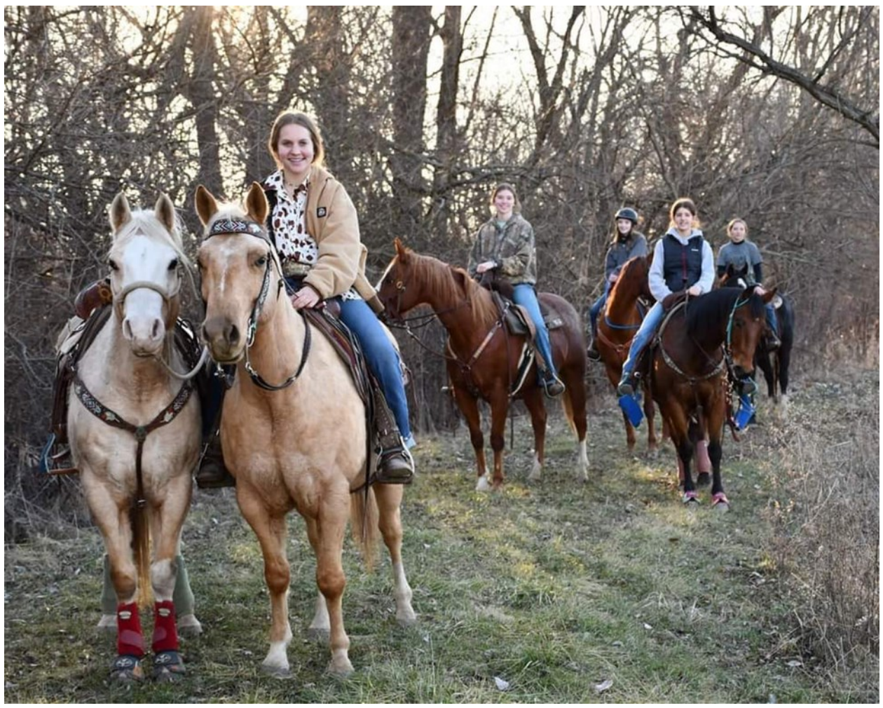
Johnson County Horse Club on a trail ride.

All of the clubs helped clean and set up the fairgrounds before and after the fair. Many club members also assisted the department superintendents during project judging.