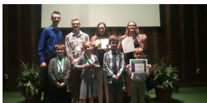
Happy Helpers 4-H Club with their awards.

On November 4th we held the annual 4-H Achievement Celebration. This event rewards 4-H'ers for all their hard work throughout the year. They fill out record books and applications in order to receive their pins and awards. We also take this time to honor club leaders and other various volunteers.